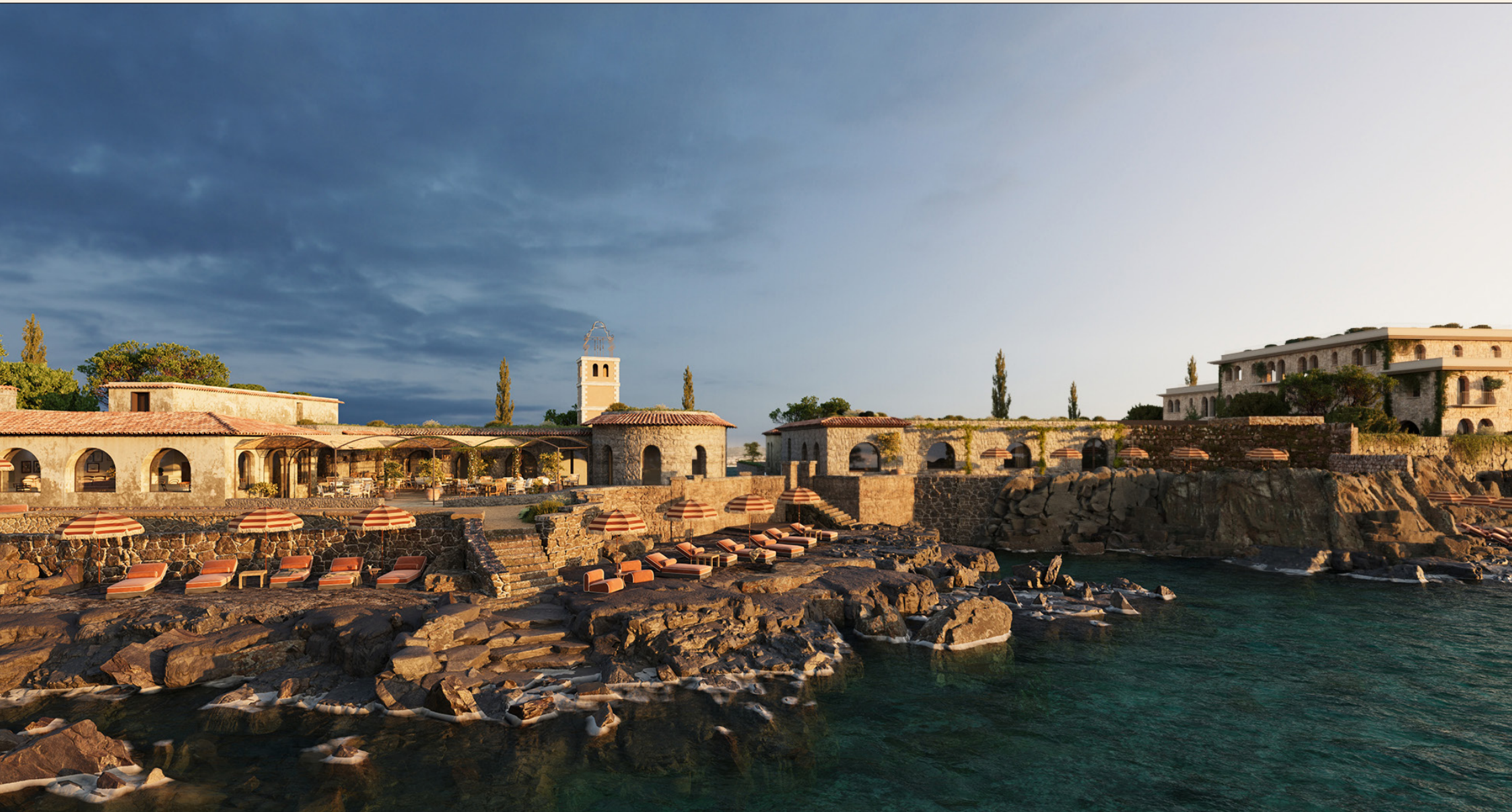
IMAGE Zannier Île de Bendor - Diving Club.