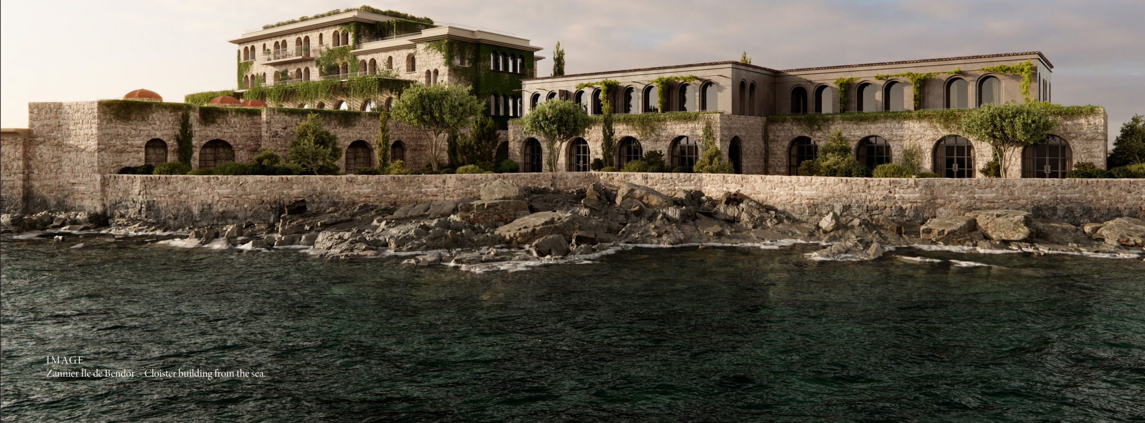
IMAGE Zannier Île de Bendor - Cloister building from the sea.