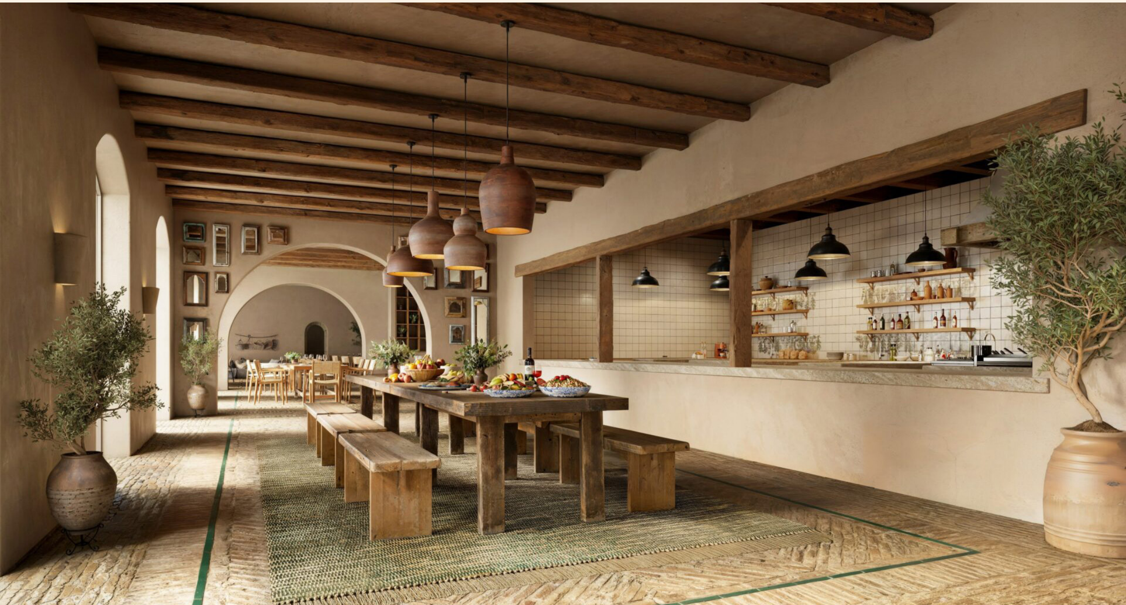
IMAGE Zannier Île de Bendor - Nonna Bazaar