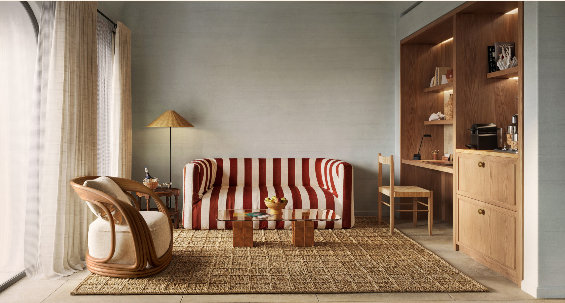
IMAGE Zannier Île de Bendor - Delos Harbour Suite Living Room.