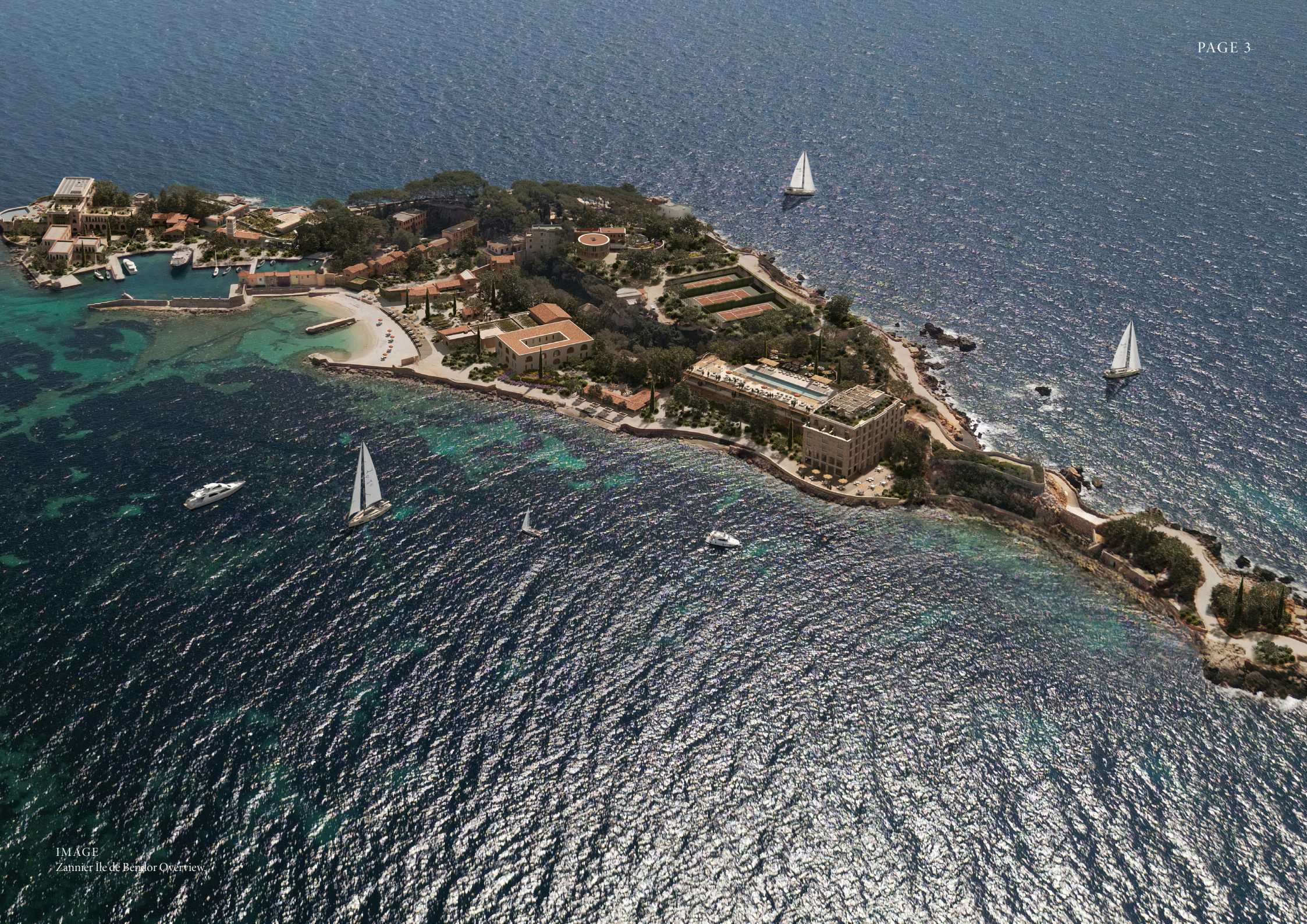
IMAGE Zannier Ile de Bendor Overview